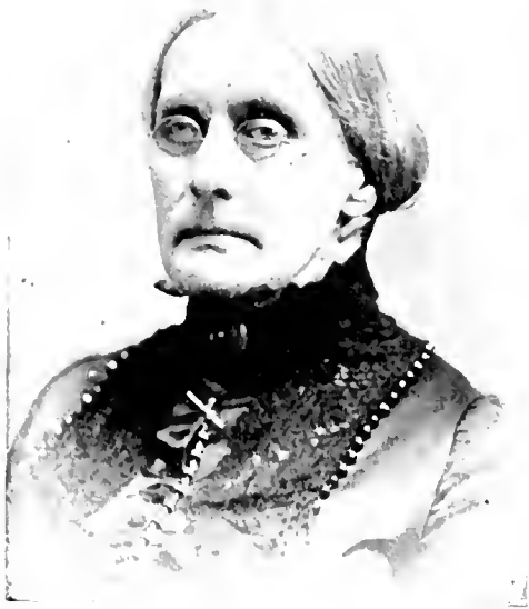
SUSAN B. ANTHONY.

ANTHONY, Miss Susan B. , woman suffragist, born in South Adams, Mass., 15th February, 1820. If locality and religious heritage have any influence in determining fate, what might be predicted for Susan B. Anthony? Born in Massachusetts, brought up in New York, of Quaker father and Baptist mother, she has by heritage a strongly marked individuality and native strength. In girlish years Susan belonged to Quaker meeting, with aspirations toward "high-seat" dignity, but this